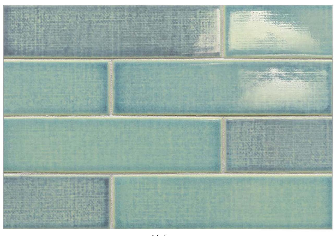
\begin{tabular}{ll} Melange \\ {\tt Glaze contains multiple color variations between pieces. Visit Facings of america.com for photos.} \end{tabular}